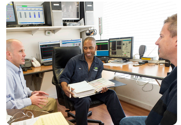
Our team works to optimize the system

Customers benefited from a chilled water rate that was 10% below the predicted rate set at the beginning of the fiscal year. Over 55% of that savings was achieved through system efficiencies and optimization. Our team took into account the lower-than-average heat index to modify our daily operational procedures to achieve the greatest efficiencies and cost savings. Our cooling operations use two primary chilled water plants, the plant on Kellogg Boulevard and the satellite plant on 10th Street. Having diverse assets allows us to balance the chilled water production across multiple chillers, utilizing the most efficient equipment first, which helps to avoid setting high electricity demand peaks. With few extremely warm days this past summer, a higher percentage of our customer's chilled water demand was able to be serviced from the thermal storage tanks, in part